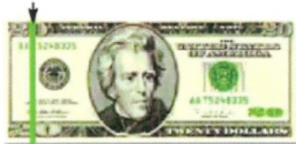
Green UV stripe